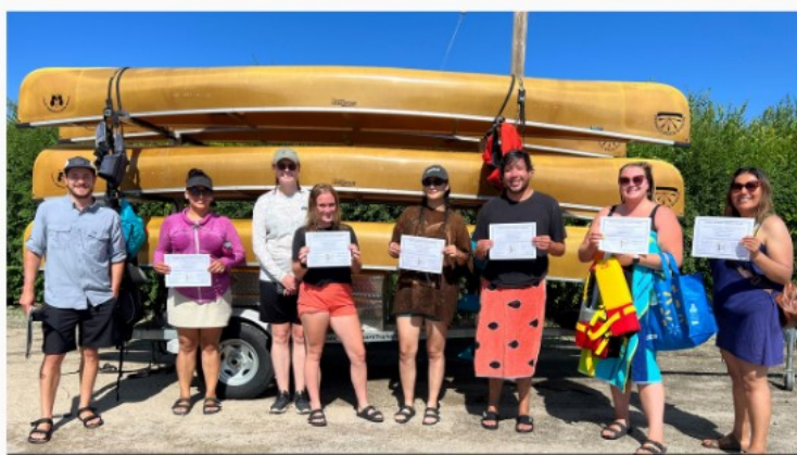
Intro to Tandem Canoe Course Certificate program with Paddle Canada

Our interns and summer students stayed busy this summer. They worked at Bagagikendamowinikaaning (Ottertail), helping to prepare the building and surrounding space for programming.