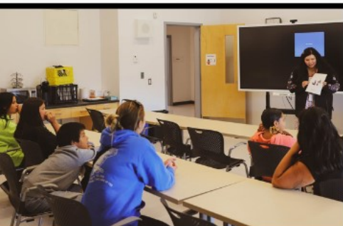
Activities & Games with Weechi-it-te-win Developmental Services

They participated in and facilitated language learning opportunities at numerous community and organizational events, often collaborating with communities and organizations to integrate language into their programs.