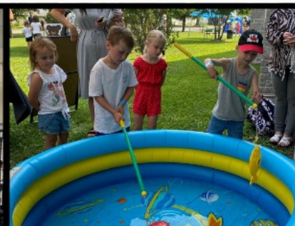
Teddy Bear Picnic Language Fishing Activity