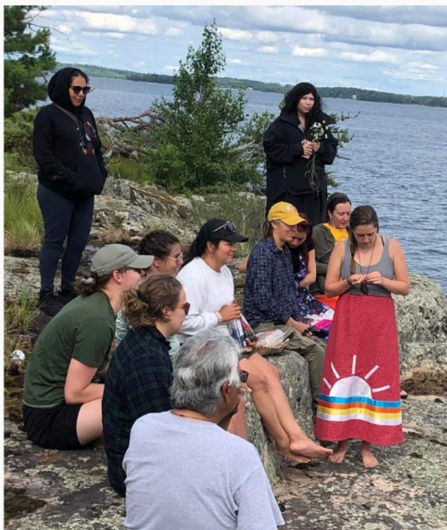
Rainy Lake Sacred Sites tour and acknowledgement with Niigaaniibines & Pebaambines

They participated in and facilitated language learning opportunities at numerous community and organizational events, often collaborating with communities and organizations to integrate language into their programs.